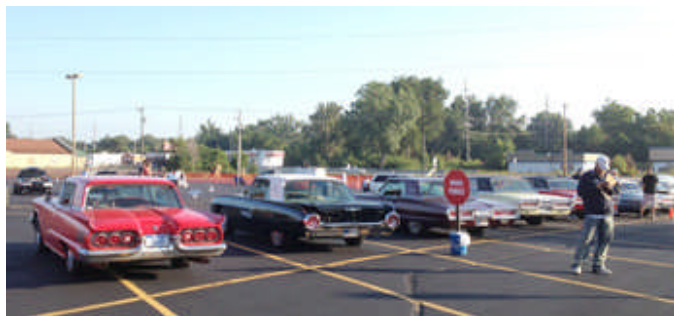
The Michiana T-birds took home this year's Club Participation Award. Six different clubs took part in the show.

97 cars were entered in this year's show, including 18 member cars and 21 Fords