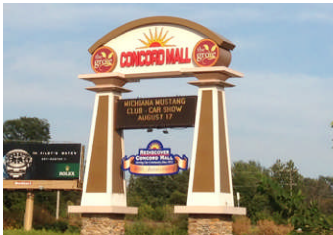
Concord Mall let everyone know we were on site.

We could not have paid for better car show weather than what we had this year; sunny with highs in the low to mid-eighties.