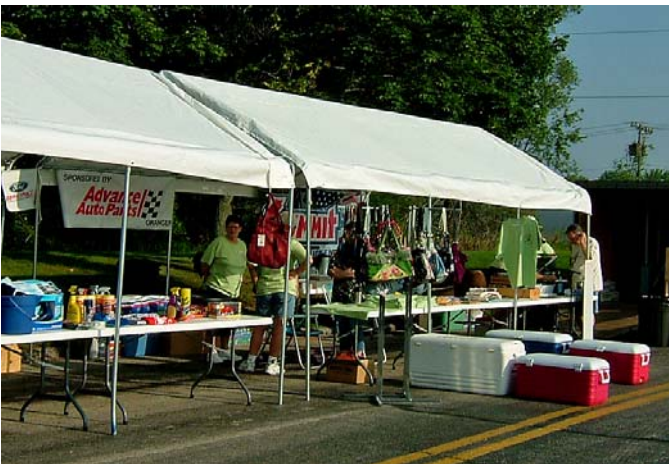
The Club Sales area was also ready