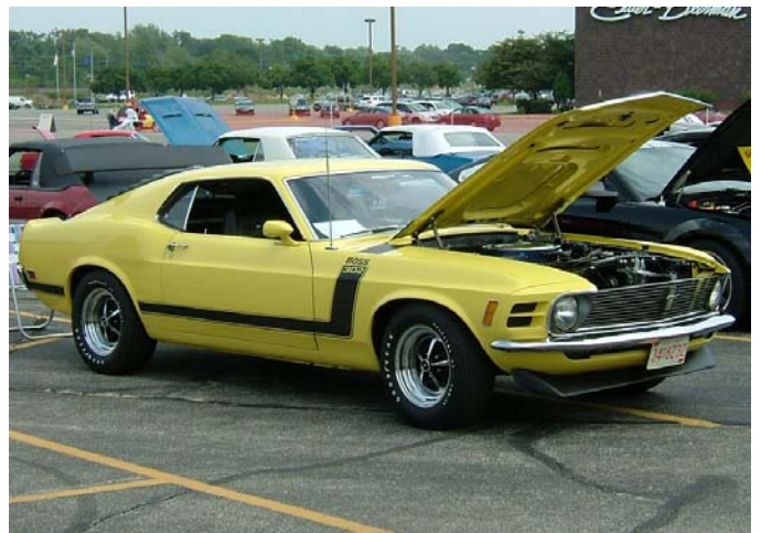
This beautiful Boss 302 won its class and the Judge's Choice Award