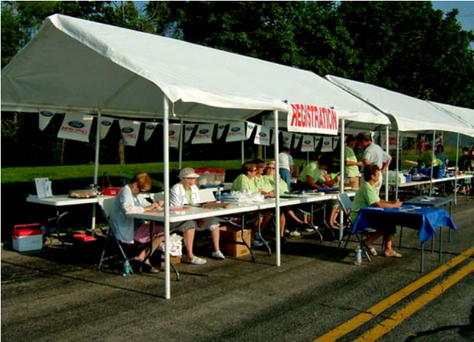
Registration prepares for the rush...

A big thank you goes out to everyone who put in a request for good show weather. I'm not sure we could have had better weather if we had paid for it.