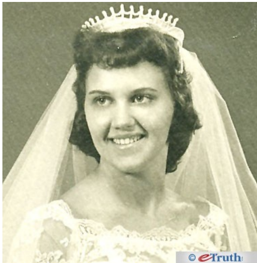
The lovely bride