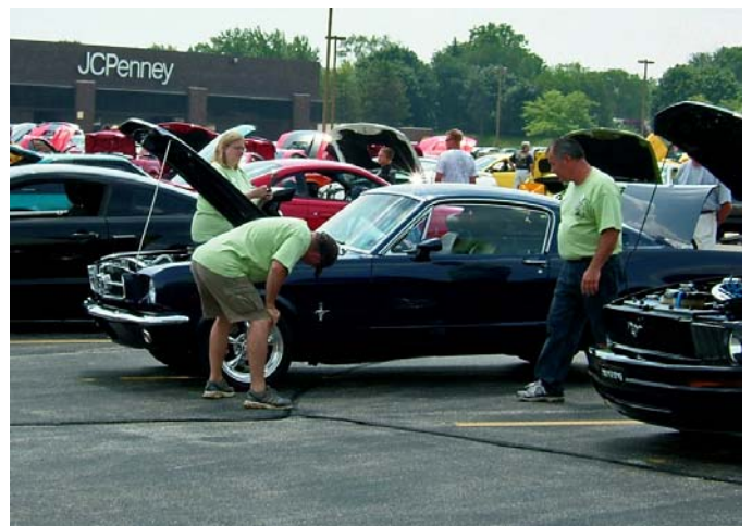
As usual, the judges did a thorough job...