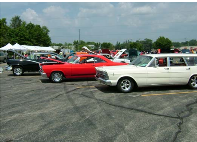
We had a good variety of non-Mustang Fords

A total of 123 cars were on site, a nice increase over recent years. Thanks to all who took part in the show. Hope to see you back next year!