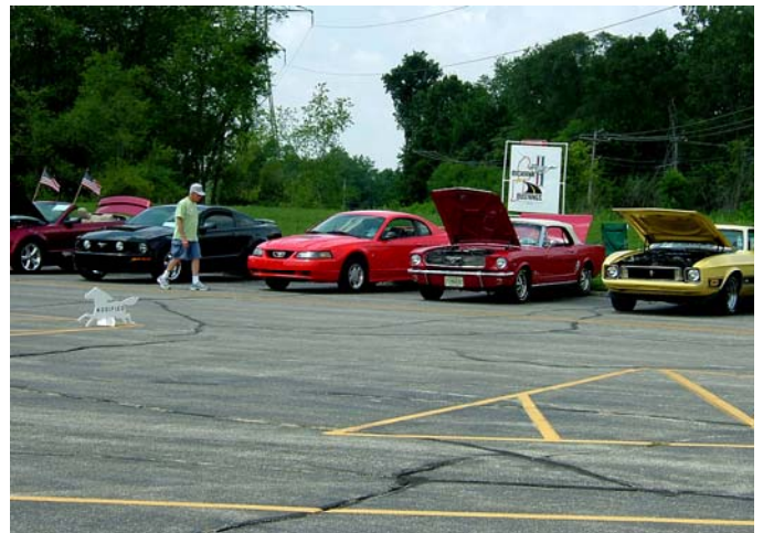
Member cars on display