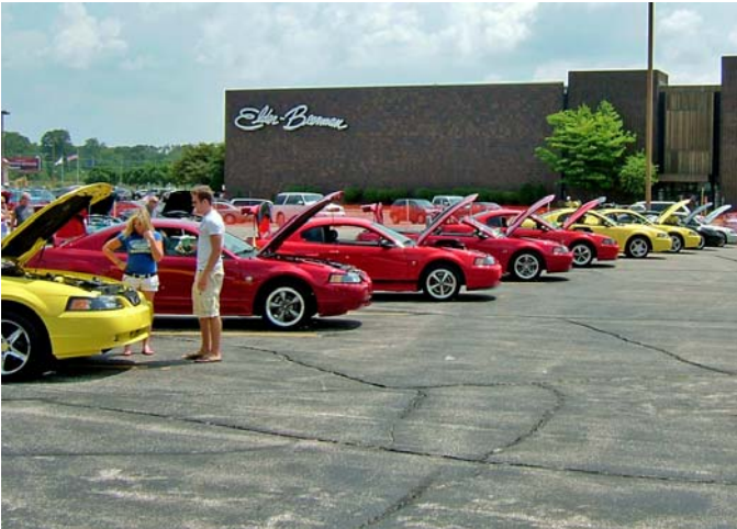
1999—2004 was a popular class