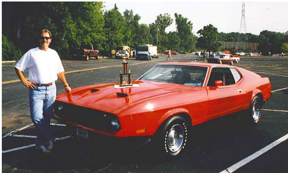
We finally have another car story! See pages 6 and 7.