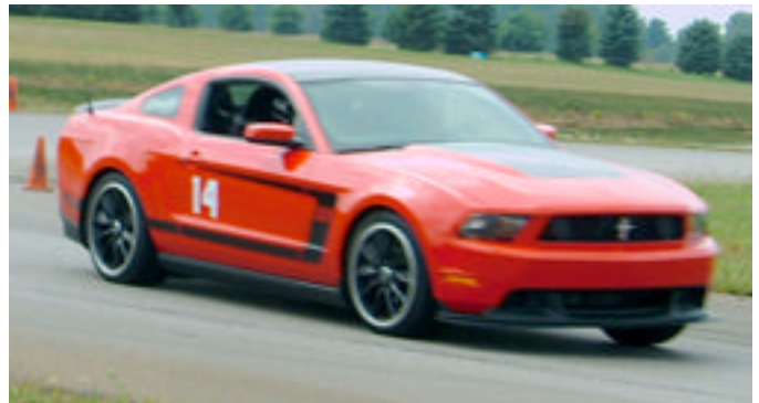
The new Boss 302 was easily the fastest car of the day. Of course the fact the David regularly competes in SCCA Autocrosses may have something to do with that.