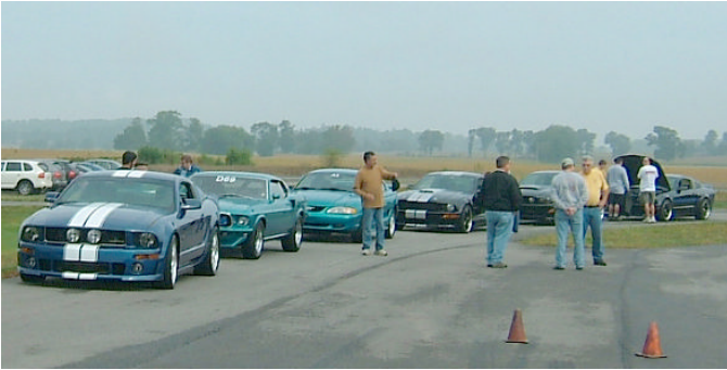
Before the start...