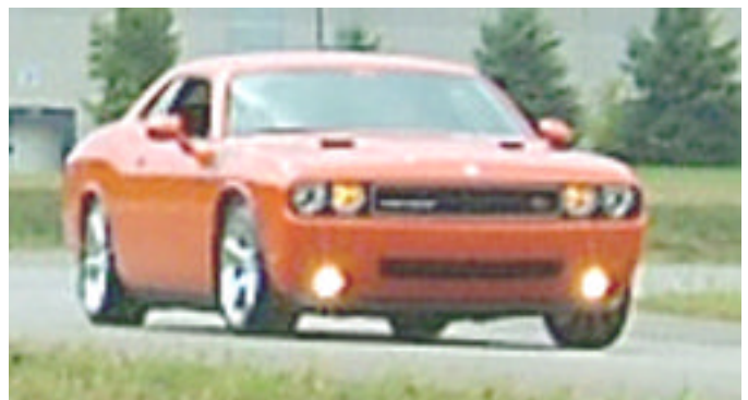
This was the darndest-looking Mustang we'd ever seen, but we let it run anyway.