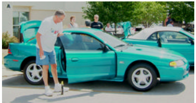
A common sight at car shows...