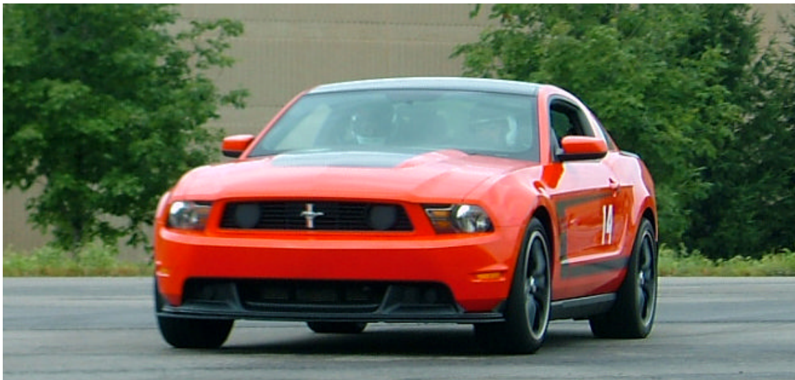
The Boss of the TireRack? See page 6