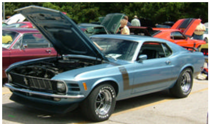
Bosses of all types were on display