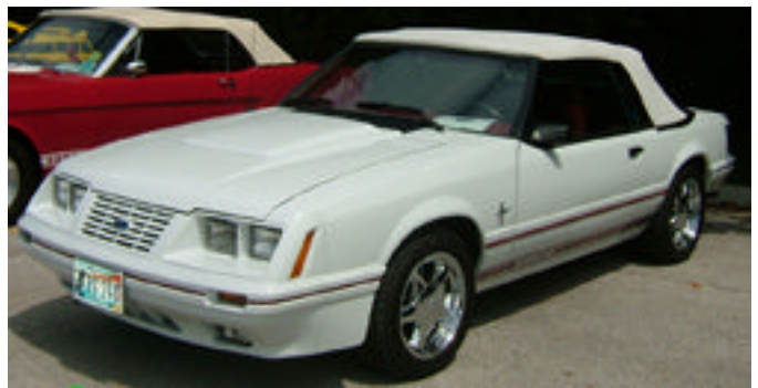
20th Anniversary Mustangs were out in force in Iowa