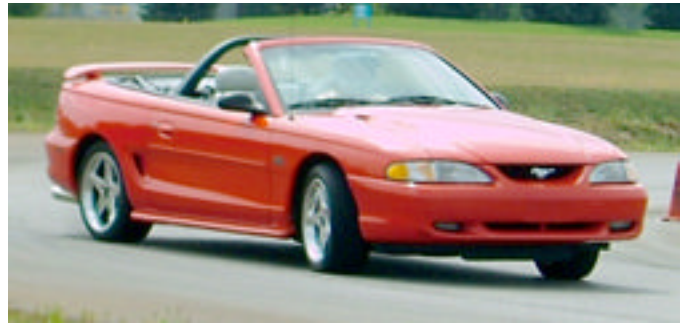
As usual, Pete McClure let it all hang out on the track