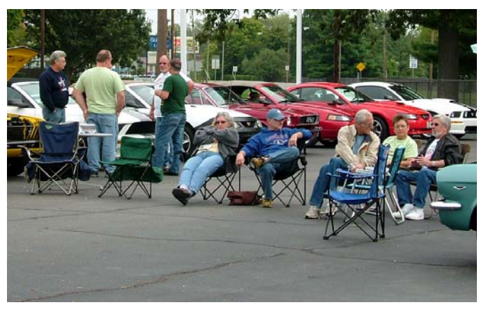
Not everyone has 'his and hers' Machs