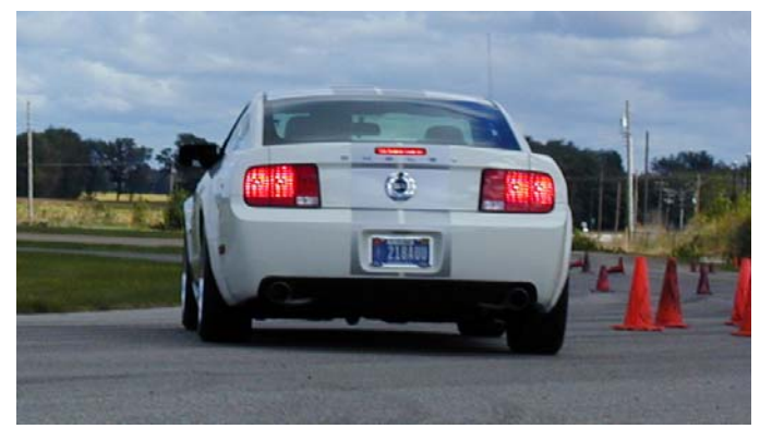
Bill Sailors had one of the two Shelbys to make runs