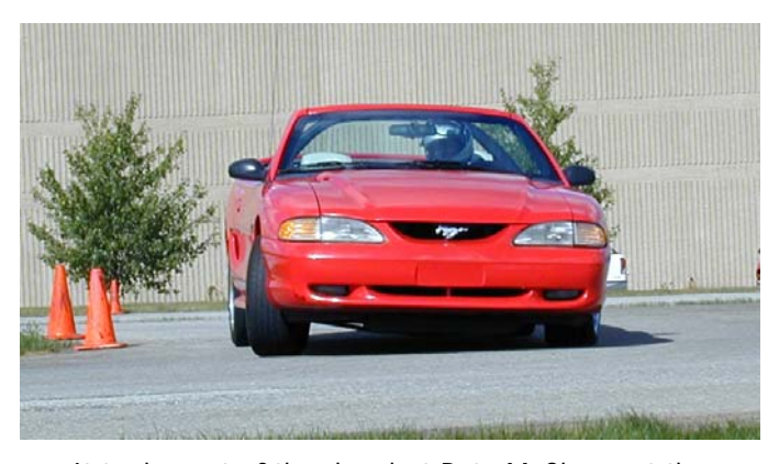
It took most of the day, but Pete McClure set the fastest time of the day at 48.4 seconds.