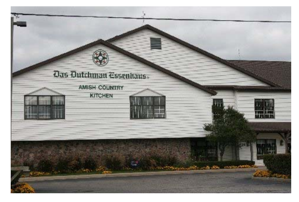
Have breakfast at Das Essenhaus

Bring your cameras and a CB radio if you have one. Hope you'll be able to make it as this museum is truly worth seeing. For more information contact Brad at 574-674-4321 or bradkmill@aol.com