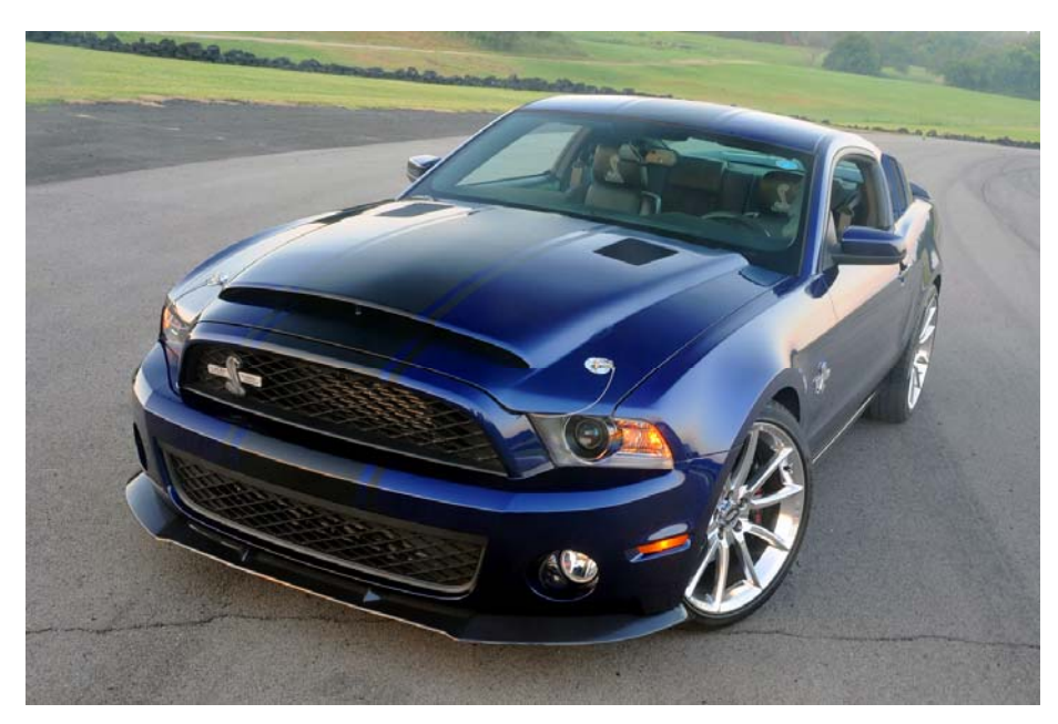
2011 GT 500 Super Snake announced...details on page 10