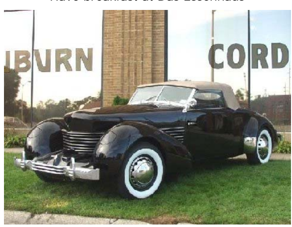
Spend the morning at the ACD Museum