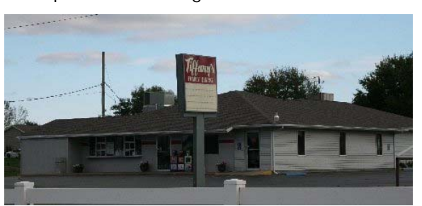
Lunch at Tiffany's in Topeka