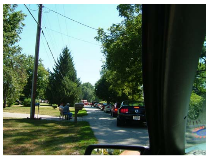
Heading for downtown