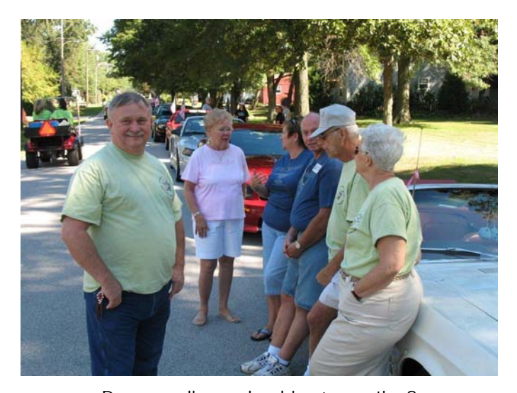
Do we really need a driver's meeting?