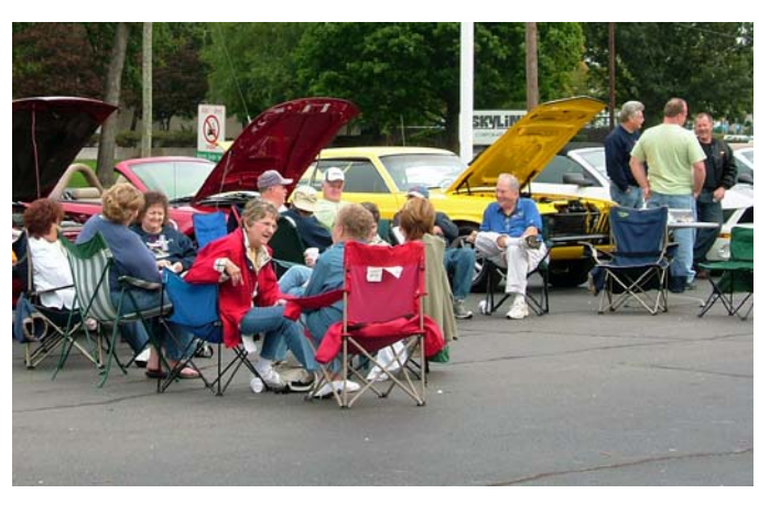
It was a good day for visiting