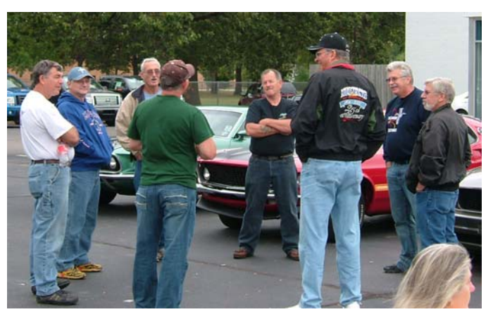
Some discussions lasted most of the day...