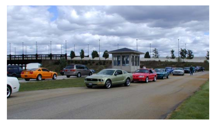
There was usually a line waiting for their next run

Drivers totaled 154 laps throughout the day. David Anson logged the most laps; 22. Pete McClure followed with 16.