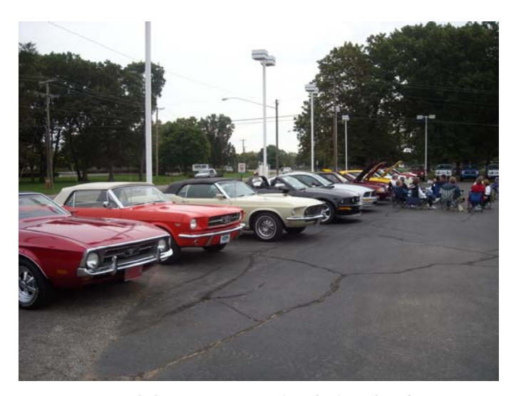
Part of the 22 cars on site during the day