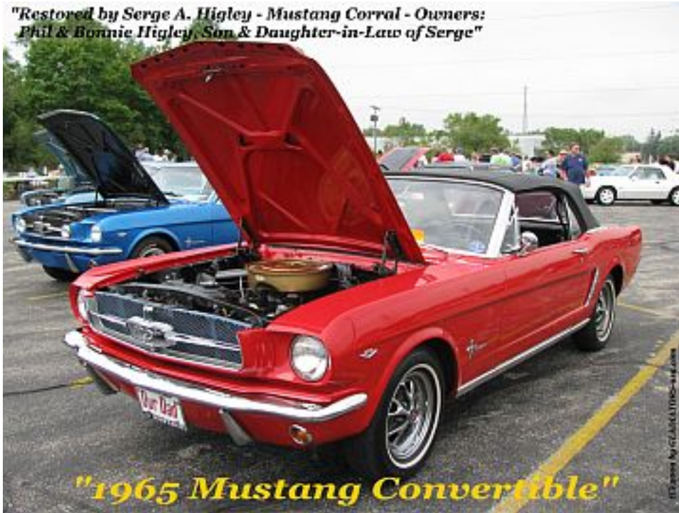
"1965 Mustang Convertible"