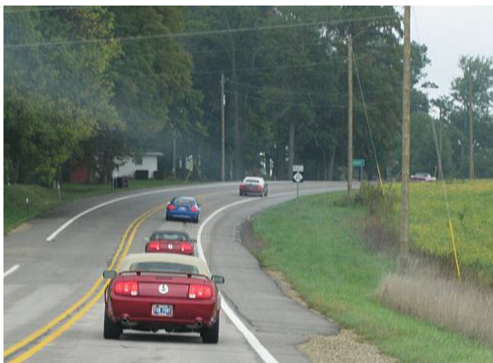
Mustangs on the road