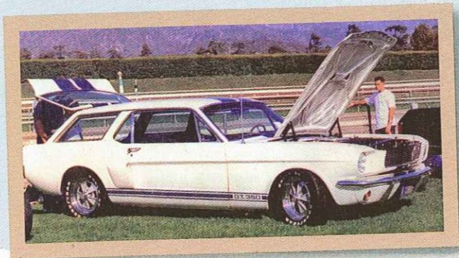
HEMMINGS CLASSIC CAR | NOVEMBER 2008 Hemmings.com

So when Craig Whatley sent in this photo of a 1966 or so Shelby G.T. 350 station wagon and claimed Ford built two first-generation Mustang station wagons for production evaluation, we had to investigate. It seems Ford did play around with the idea of a Mustang wagon in the styling studios around 1966, and we've found evidence of a very similar Mustang wagon that Intermeccanica built around 1965, but we have yet to turn up proof of a Shelby wagon or a single word to back up Craig's claim. If you know better, though, write in and share your knowledge.