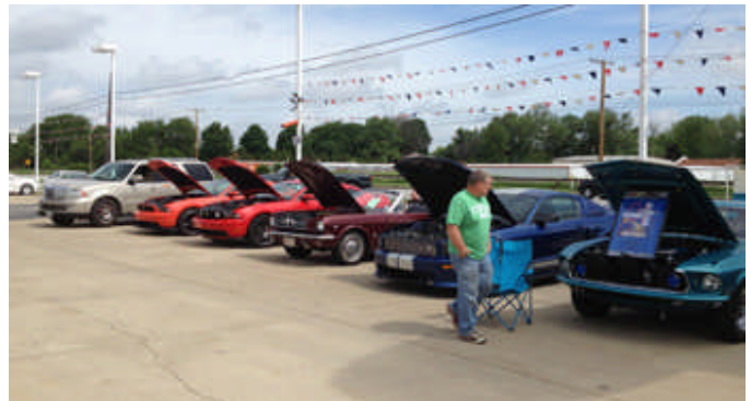
Quite a few people stopped by to see the cars throughout the day