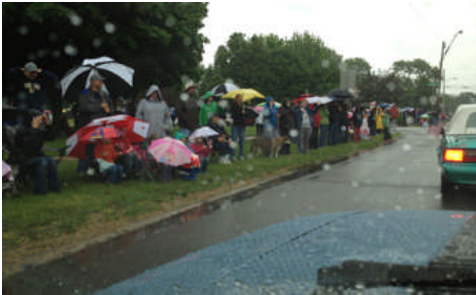
It takes more than rain to keep South Benders away from their parade!

We warmed up at Honkers over breakfast and then headed to Elkhart for the last one. Once again four cars in that parade. But those Mustangs dried off and will be ready for whatever's next. Thanks to everyone for participating, especially those that did all three!