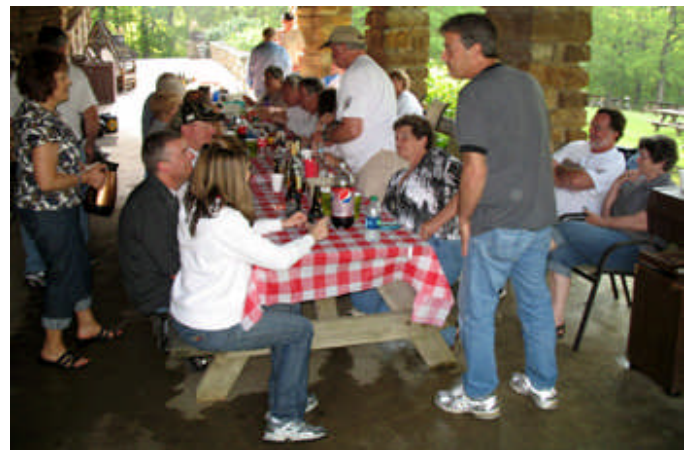
As usual, the picnic was a highlight of the weekend.