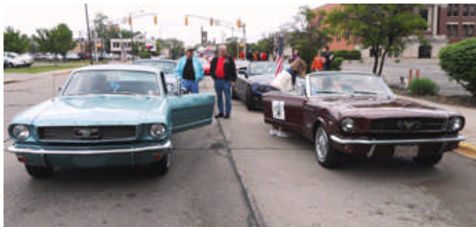
Elkhart... finally the rain stopped. Thankfully, you can't see the 10 or 12 Corvettes behind us!