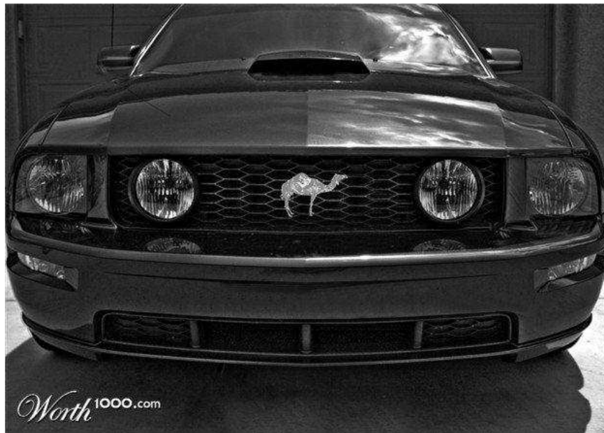
A new grille badge for the Ultra High-mileage Mustang??