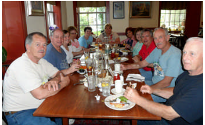
Thursday night supper at the Artists Colony