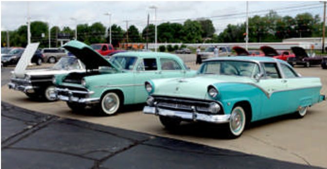
The parking lot wasn't just for Mustangs on Saturday.