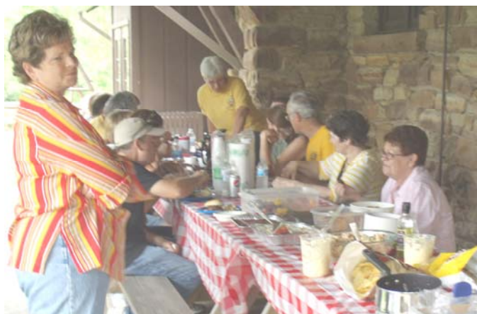
As always, Saturday night's picnic was a fun time