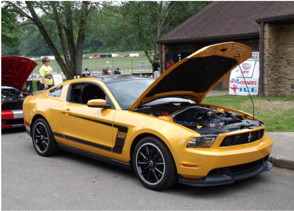
Boss 302 Mustangs invade Brown County...more on page 4