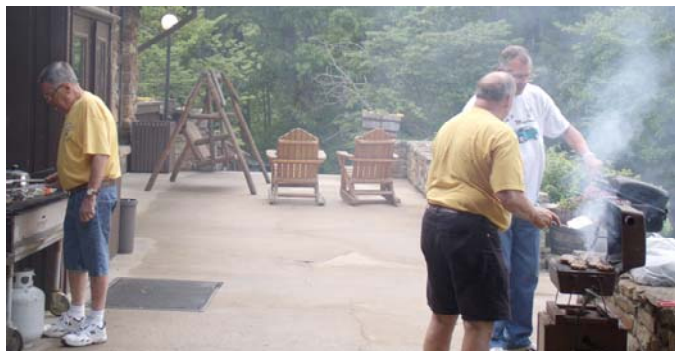
Grillmeisters at work