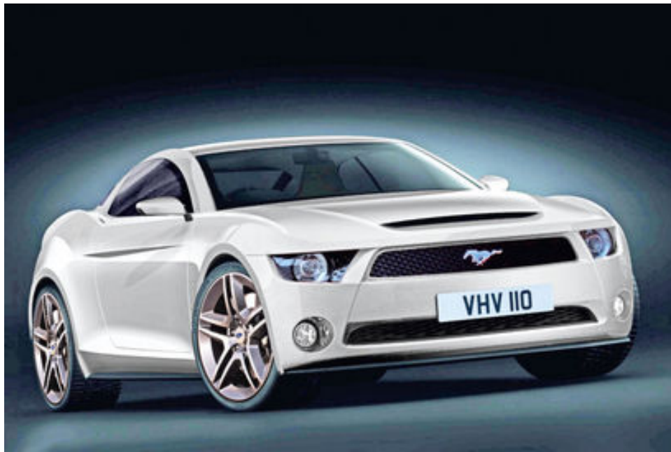
Is this the 2014 Mustang? See page 7