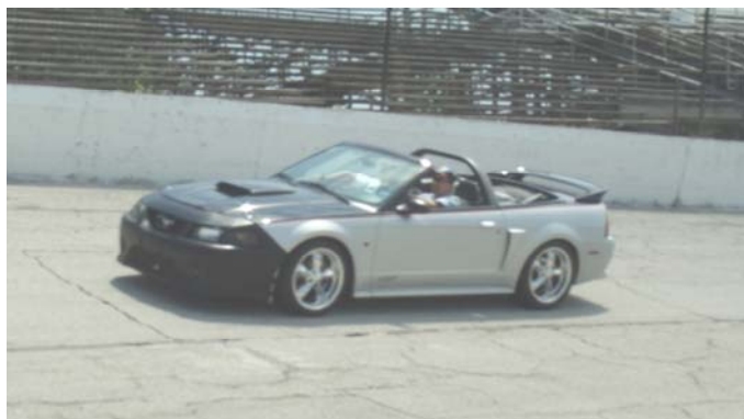
Kevin Price got track time at Salem Speedway during Friday's Pony Trail