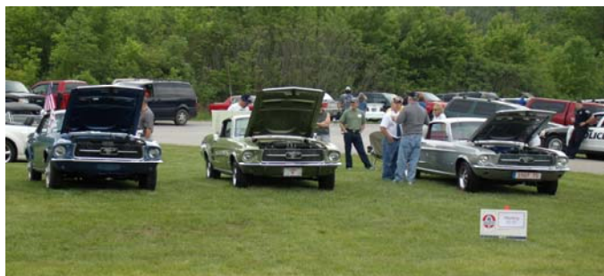
Michiana Mustangs made up the '67-73 class