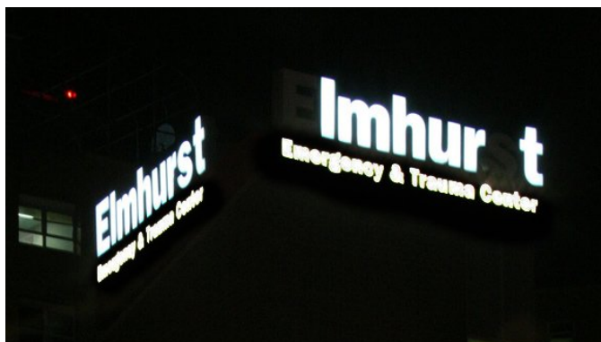
Chester Higgins Jr., The New York Times

Read more: http://www.autoweek.com/article/20110616/CARNEWS/110619880#ixzz1PYJiWuA7