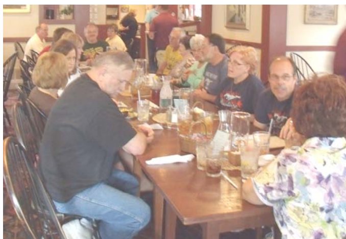
As usual, Friday night's dinner was a lively affair