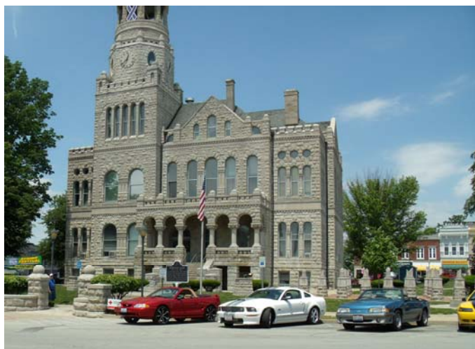
Mustangs surrounded the Court House in Salem