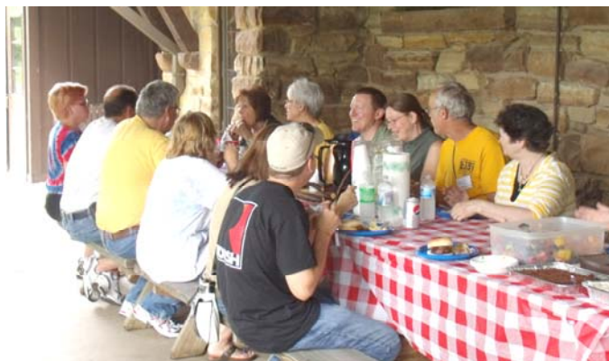
Once again, the cooking won approval from the crowd