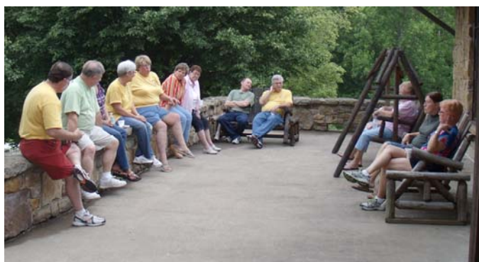
Relaxing after dinner and clean-up