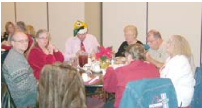
Even for a Packer fan THIS loyal Santa couldn't deliver an undefeated season