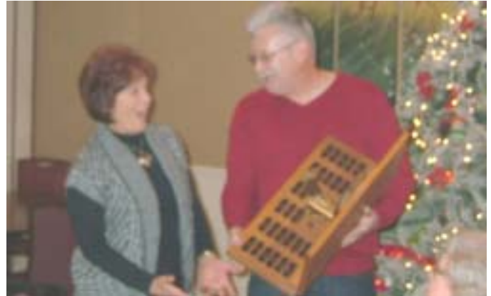
From a classic Christmas movie... "If I woke up tomorrow with my head sewn to the carpet, I wouldn't be more surprised than I am now." *