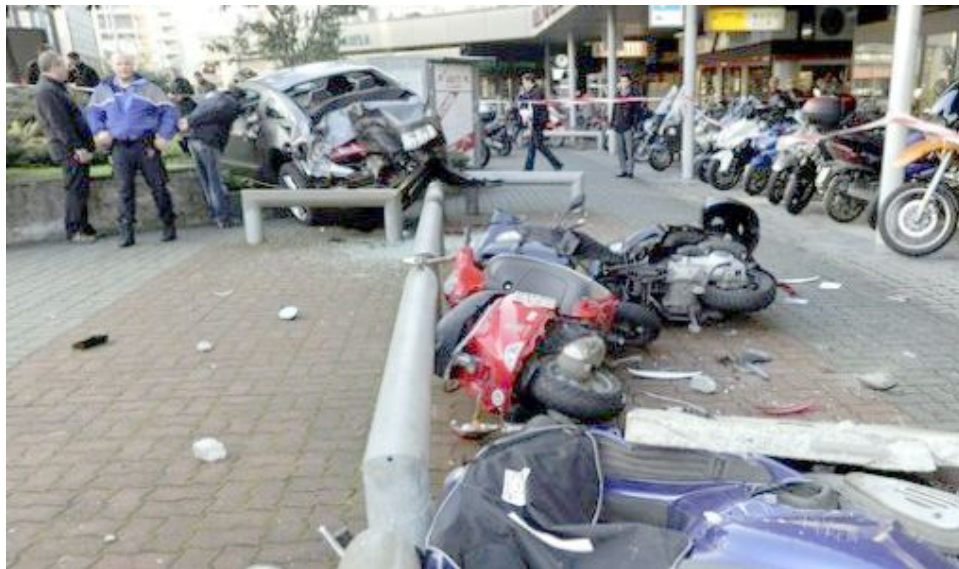
This Mustang took a wild ride... see page 7