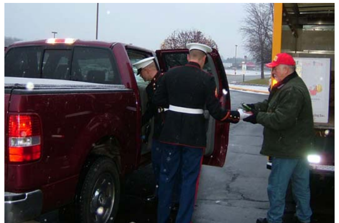
Local Marines unload our donations to fill one of the three and one half trucks filled that day.