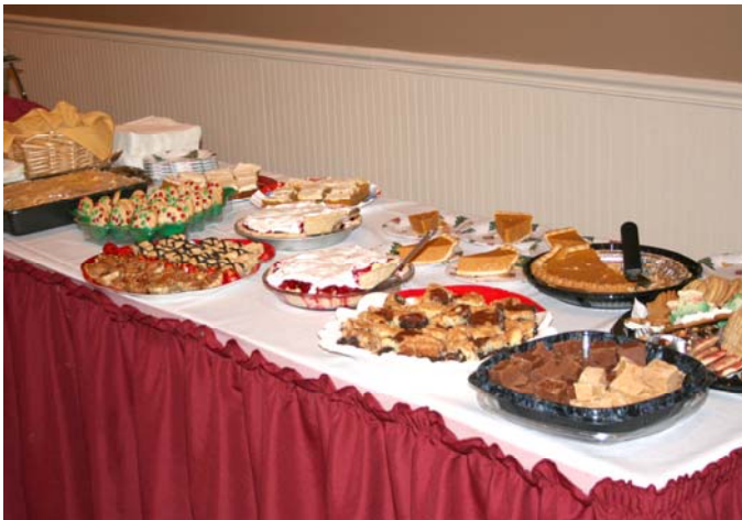
To no one's surprise, club members supplied a tasty selection of desserts.