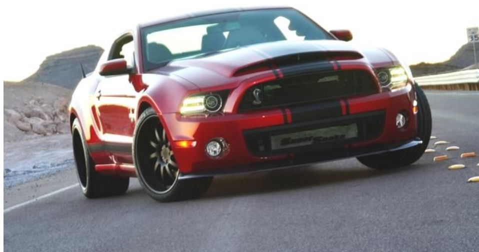
The 2013 Shelby GT500 Super Snake wide body makes its debut in Detroit. Story on page 6.