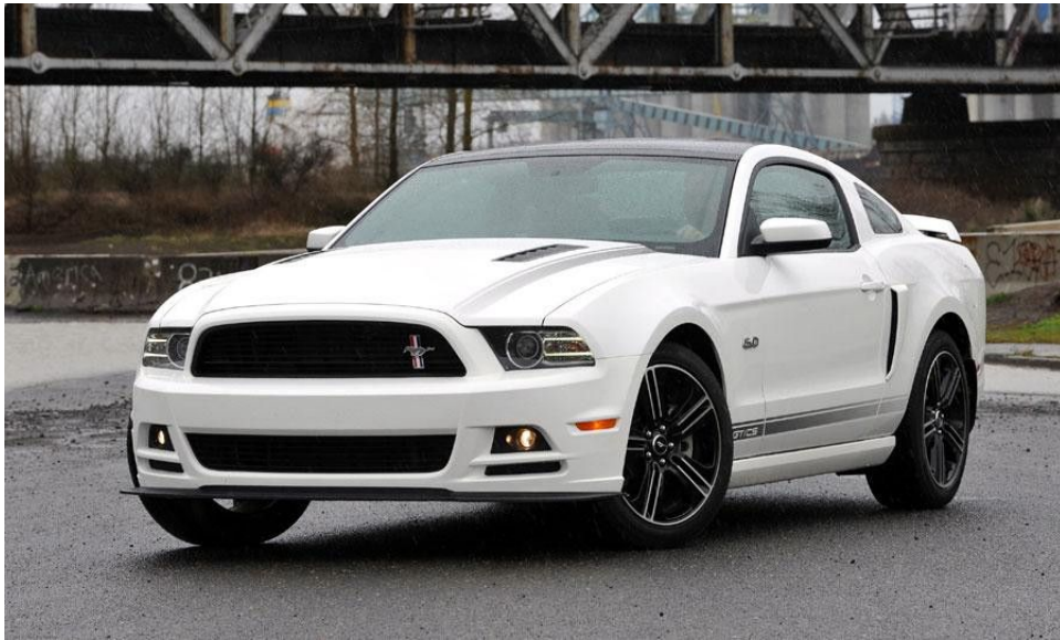
The California Special will be back for 2014 (see page 5 for more information)