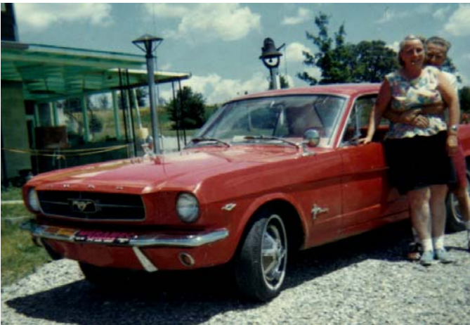
Roger Kaser's parents with their '65 Mustang