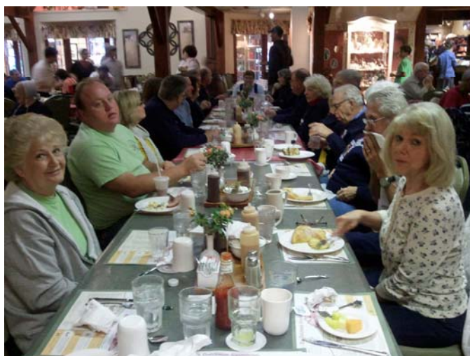
Breakfast drew a big crowd; what a surprise!