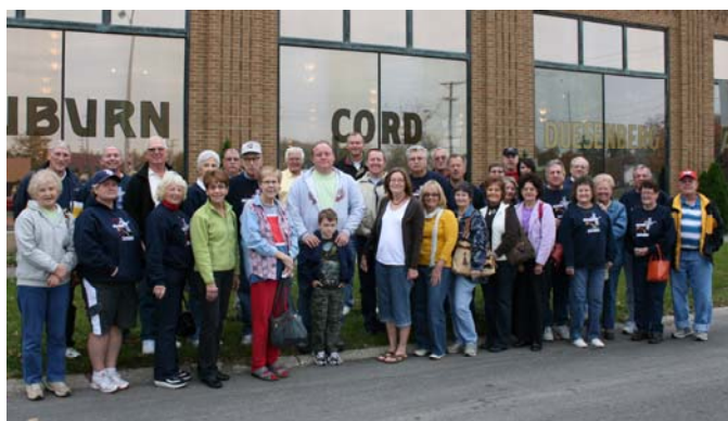
Our group outside the museum