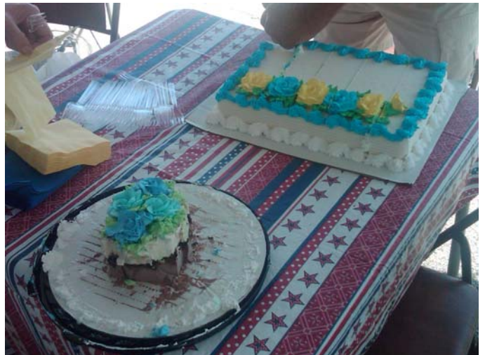
Mona's ice cream birthday cakes were a welcome dessert on a hot day