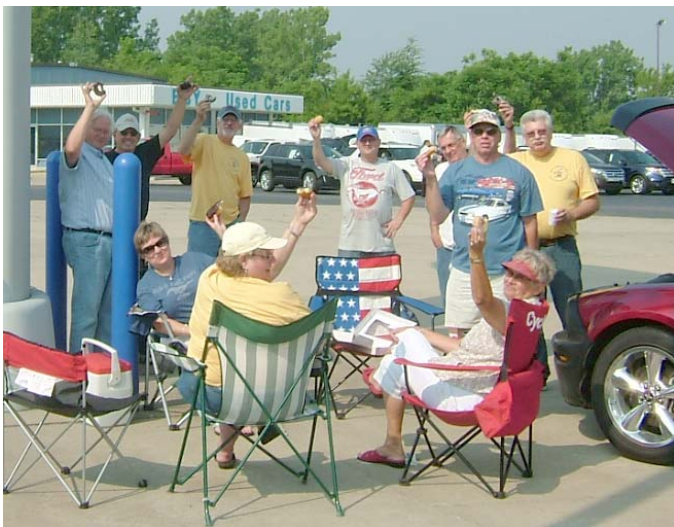
Fresh doughnuts and coffee — breakfast of champions