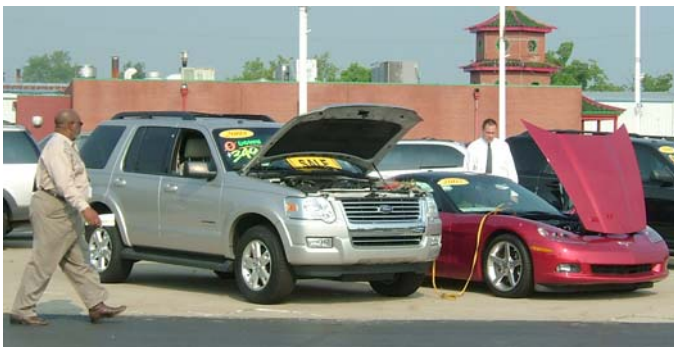
Show and Shine special — buy a Corvette, get the remote starter for only $349 a month