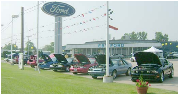
Good weather and a nice selection of Mustangs greeted visitors and passers-by