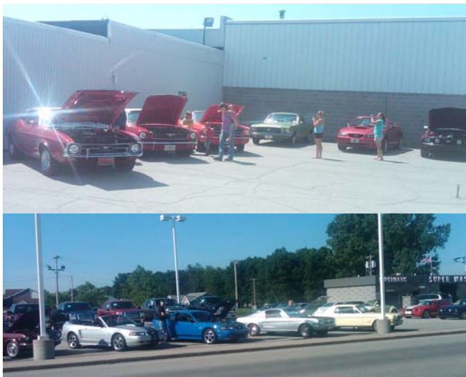
A portion of the 23 cars on display at Bremen Ford