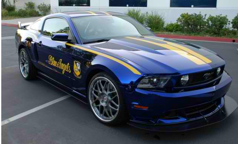
Another one-off Mustang is being auctioned. See page 7.