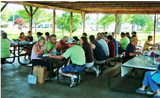
As usual, we had a good turnout