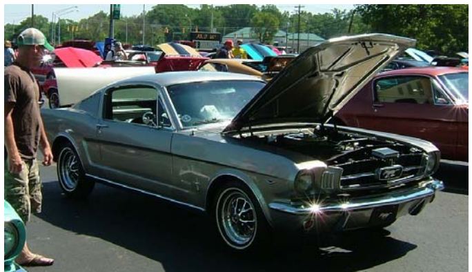
This Mustang came all the way from Alabama for the show and took the Sponsor's Trophy home for their efforts.

Look all you want, but please don't touch!