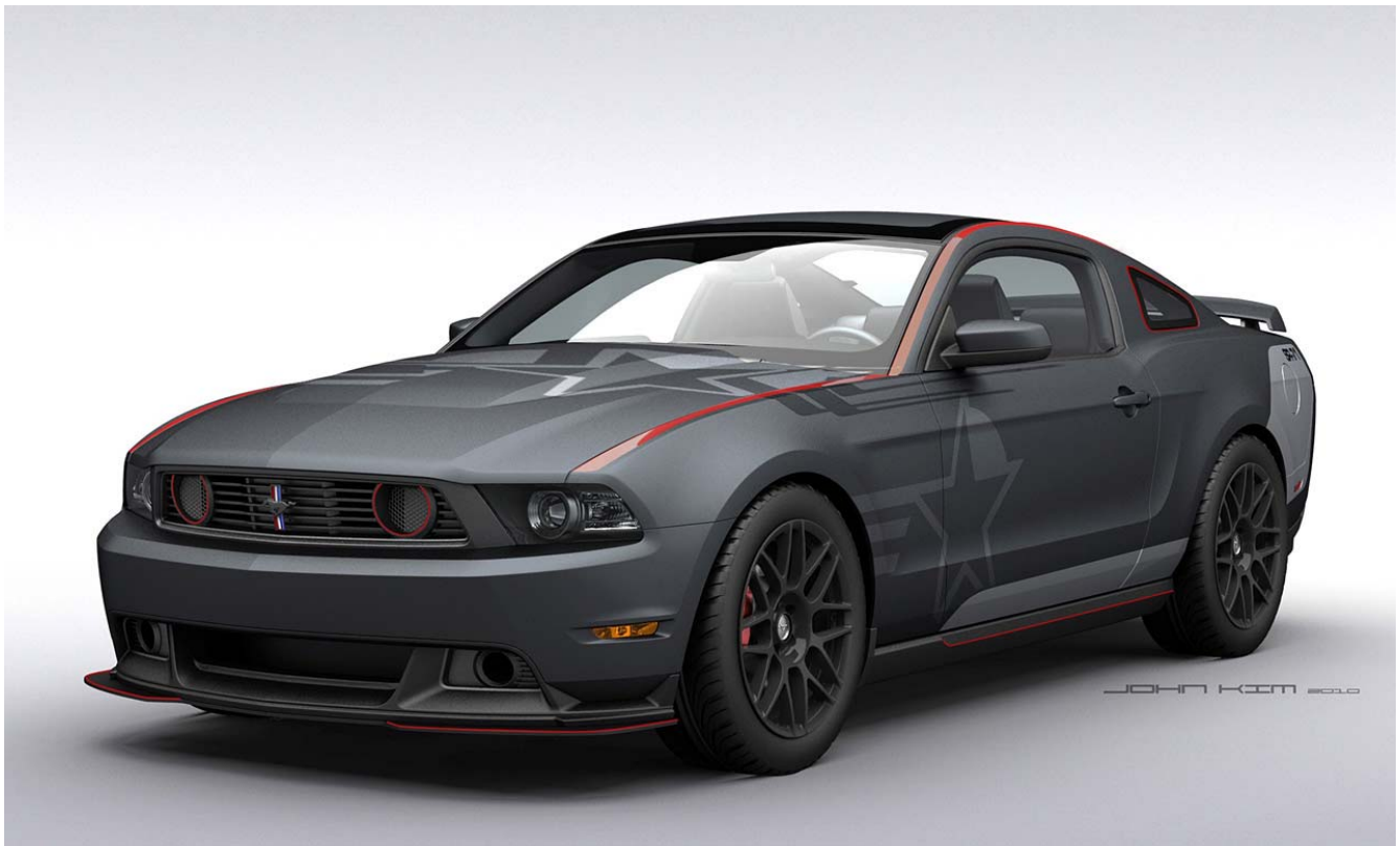
Ford, Roush, and Shelby team up for charity...details on page 7