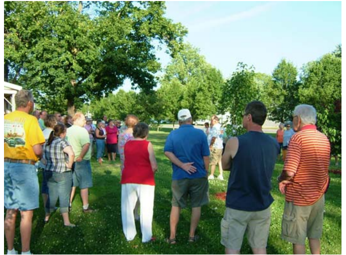
We remembered our lost friends