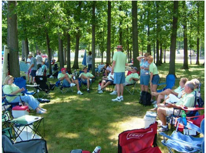
The knoll was the place to be after your car was clean

Hopefully you will be convinced to give this show a try. We are pretty sure you will agree that this is one of the best.