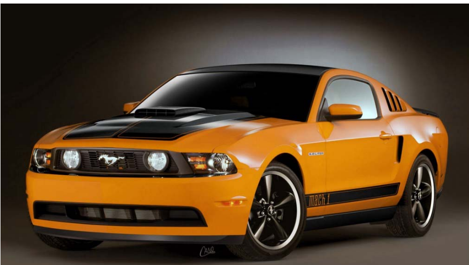
Artist's concept of a 2011 Mach 1 (there are no currently announced plans for such a car)