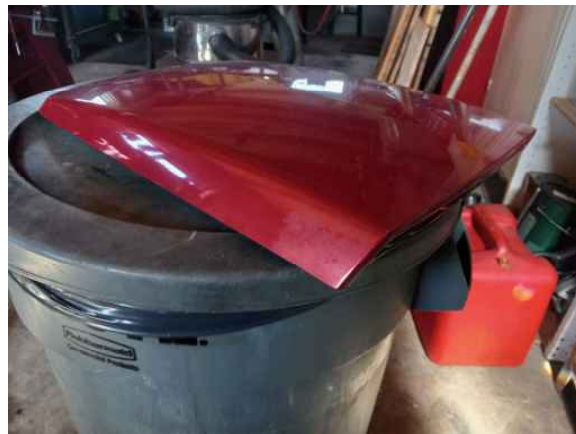
Hood Scoop for 2005-2009 Mustang GT $75.00