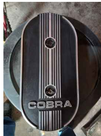
FE 427 Dual 4-barrel Air Cleaner $350.00