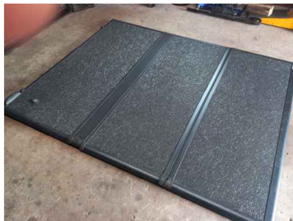
Encore Tonneau Cover for 6 1/2' Ford Bed (Super Body only) $350.00

For more details, call Jerry at 269-350-6040