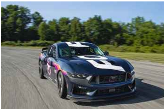
The Dark Horse R offers newcomers to racing an accessible entry point and is eligible for both the Mustang Cup and – once the driver has gained a bit of experience – the IMSA-sanctioned Mustang Challenge.