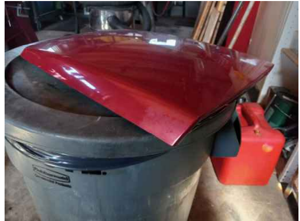
Hood Scoop for 2005-2009 Mustang GT $75.00