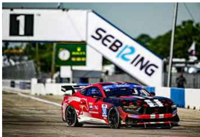
Mustang GT4s will be in the thick of the fight for Michelin Pilot Challenge honors at Sebring.

Domestically, up against brands such as Porsche, Lamborghini, Ferrari and Mazda with well-established single-make championships, there was no guarantee that Ford, even with the recognition and heritage of the Mustang, could carve out a place in the crowded marketplace and go beyond offering customers GT3 and GT4 products. Yet the numbers are already eye-opening. Fifty-five Dark Horse Rs have been built ahead of year two for Challenge, and a second series has been launched in reaction to demand.