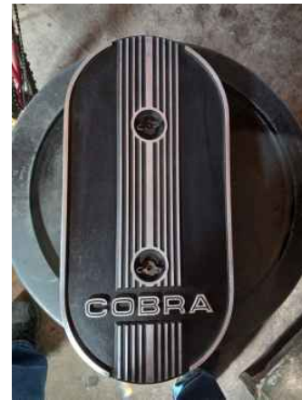
FE 427 Dual 4-barrel Air Cleaner $350.00