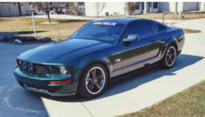
How I spend my time in the garage