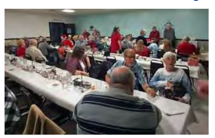
We had 49 members at Dutchmaid Eatery and Gifts in Bremen for this year's Christmas Party.