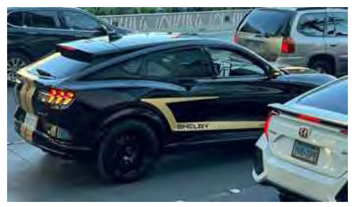
I guess the Mach-E has arrived now...