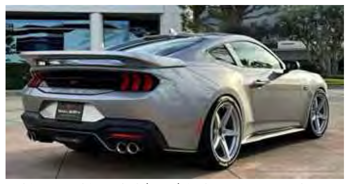
"This 302 White Label (2024) is the most comprehensive design ever for our 302 White Label. There is a lot to like about the new S650 platform," said Steve Saleen. "Much has been said about this model, and we addressed it. We are quite proud of the end result."

On the outside, the 2024 Saleen 302 White Label utilizes a host of upgrades designed to maximize airflow, starting up front with a totally new front fascia that features an aerodynamic splitter and an air damn designed to generate large amounts of downforce for cornering performance. From there, the new White Label features a revised hood vent to make it easier for hot air to escape the engine bay, along with a new axial grille and a rear wing.